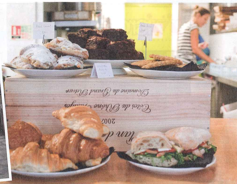
Boxing clever The Container Café, in the View Tube community venue, overlooks the Olympic building site